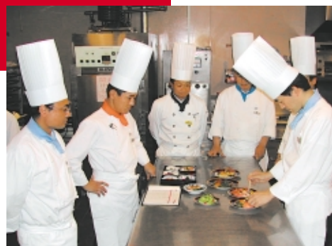
TFK Corporation chefs discuss a new in-flight menu.

As part of the overall Group reorganization, peripheral operations were reorganized and integrated to achieve greater business efficiencies.