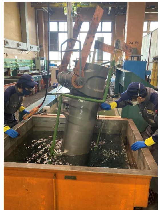
Landing Gear Rinsing Process