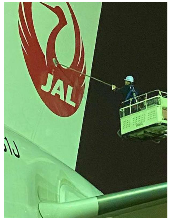
Mop Cleaning of the Vertical Stabilizer

In addition, by keeping the airframe clean through washing, air resistance during flight is reduced and fuel (CO 2 ) is reduced.