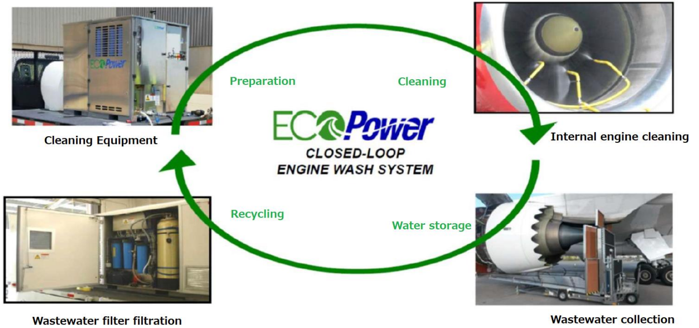
Water Recycling with Eco Power Washing Equipment

Therefore, the JAL Group regularly cleans the inside of the engines to remove dirt that has adhered in flight. This process has led to an approximate 1% improvement in fuel consumption. The engine cleaning is performed at intervals of 200 to 300 days.