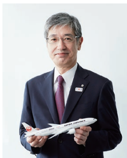
Representative Director, President Chief Executive Officer

Nowadays, the label of adventure travel is widely used around the world, so popular that there is even an Adventure Travel World Summit, held in Hokkaido this fall. This type of travel allows visitors to experience firsthand the unique culture and natural beauty of the destination to give a greater sense of