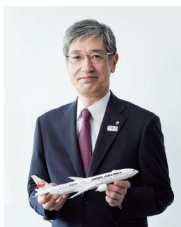
Representative Director, President Chief Executive Officer

In recent years, companies and society are placing more importance on diversity where people respect