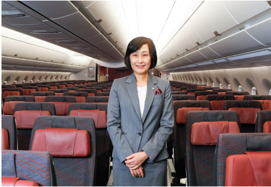
President and Group CEO

We look forward to serving you on your next flight.