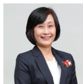
President and Group CEO