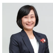
President and Group CEO